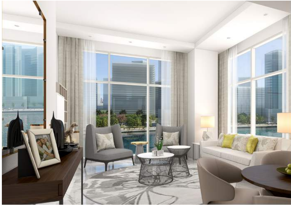
The interiors were inspired by using the latest finishes, materials and inspired by the local culture and heritage of Dubai. The use of marble, wood, stainless steel, special glass, customized carpets and high-finished ceilings create the uniqueness of "J One's" interiors.